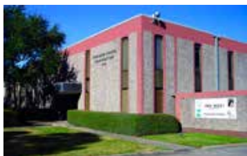
TIDELAND SIGNAL CORPORATION USA www.tidelandsignal.com