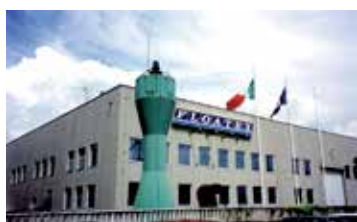
FLOATEX ITALY www.floatex.com

Copyright © 2015 Floatex s.r.l. - All rights reserved