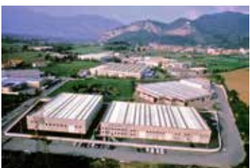
FLOATEX ITALY www.floatex.com