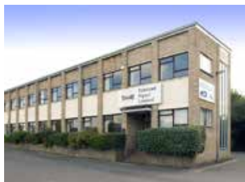
TIDELAND SIGNAL LTD U.K. www.tidelandsignal.com