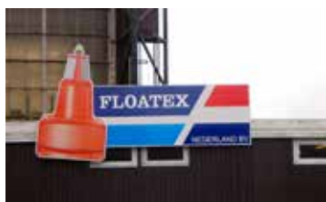
FLOATEX NEDERLAND www.floatex.nl